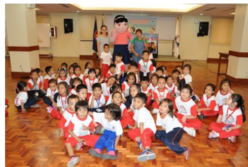
Brgy. 658 Day Care Center pupils with Melai d' mascot